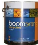
plastic paint cans