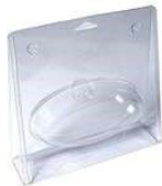
Moulded retail Packaging or non-medical blister pack (boxboard & paper removed)